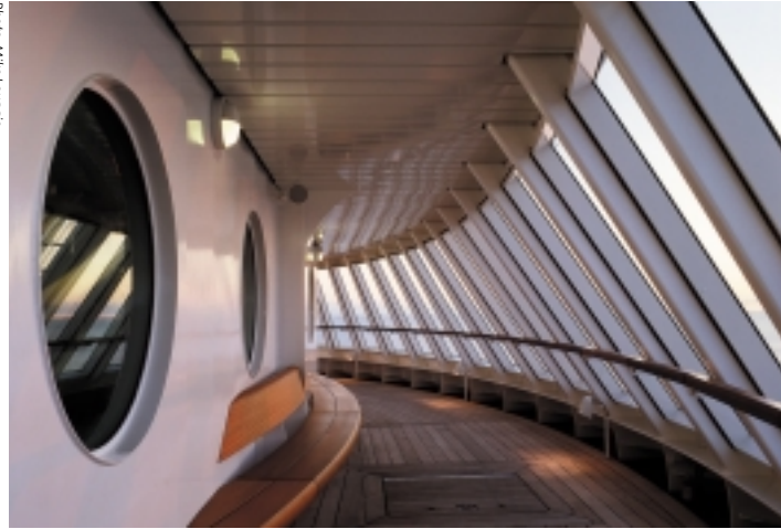
PORHOLE WITH SGG CONTRAFLAM LITE MARINE.