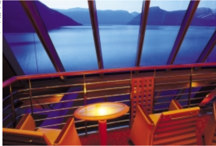
SGG PYROSWISS MARINE, FOR A PERFECT VISION.