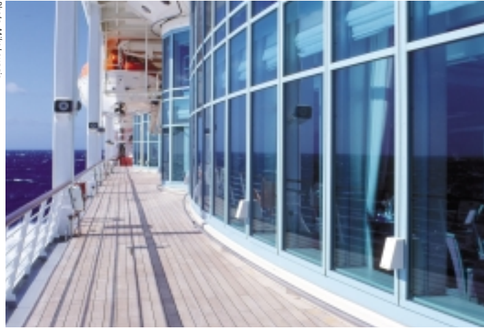
SGG PYROSWISS EXTRA MARINE, FOR MULTIFUNCTIONAL USE.